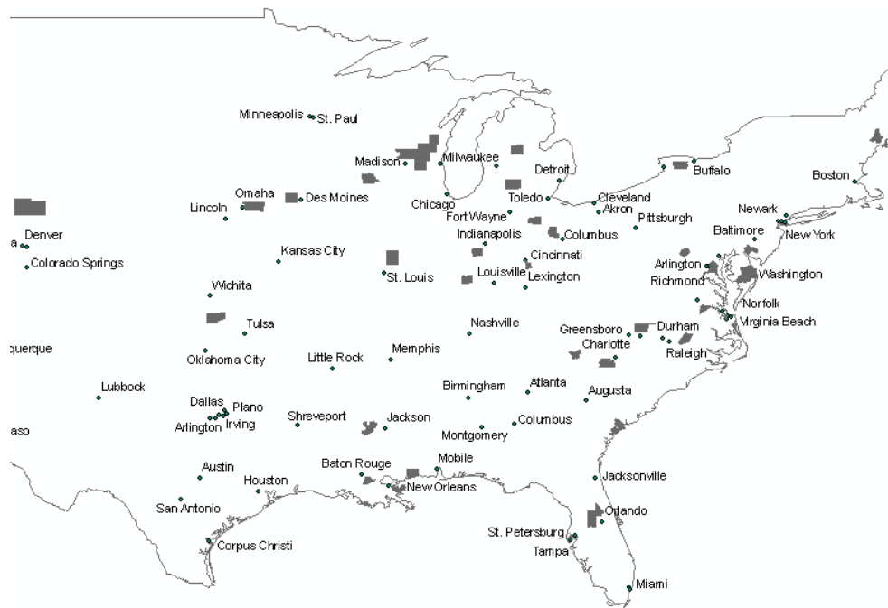
Figure 4. Counties with at least 275 Persons Employed as Computer Specialists in the year 2000; 41.4% or more of which were women.

In order to address and equalize the variation in county populations, a spatial query was created and executed against the map depicted in Figure 3. The criteria for this query were set by the indicators of good Computer Specialist job occupancy by women identified through this study. The first indicator is that on average, in the year 2000, 41.4% of Computer Specialist jobs were occupied by women. Therefore in the spatial query, only counties where at least 41.4% of their Computer Specialist positions were held by women were considered to be regions where women have made headway in bridging the Digital Divide. In addition to that criterion, one other was also set. Counties with extremely high percentages of women in Computer Specialist jobs, but with very few total Computer Specialist jobs overall, can skew the results to appear as if good opportunities for women exist in a geographic region, when in fact they do not. By calculating quartiles by number of Computer Specialist jobs in each county, we find that the top 25% of counties in the United States in the year 2000 had at least 275 Computer Specialist jobs. Therefore, the second criterion set forth in the spatial query required that any county selected as a location demonstrating good Computer Specialist job opportunities for women must have had at least 275 persons employed as Computer Specialists in the year 2000. Figure 4 depicts the results of this query.