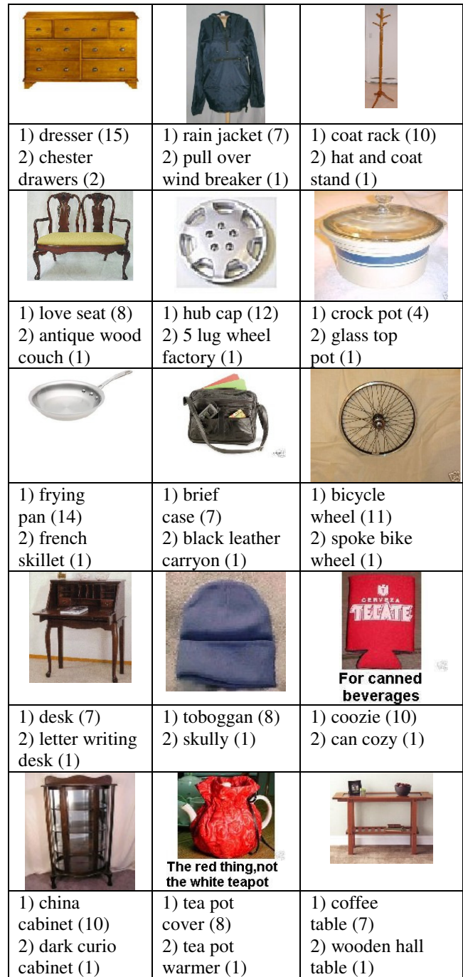
Figure 1. Images of eBay Products Used for Initial Search Task with Frequency Counts for Most Popular and Less Popular Keyword Search Terms (N = 36)

products used in the initial search task appear in Figure 1.