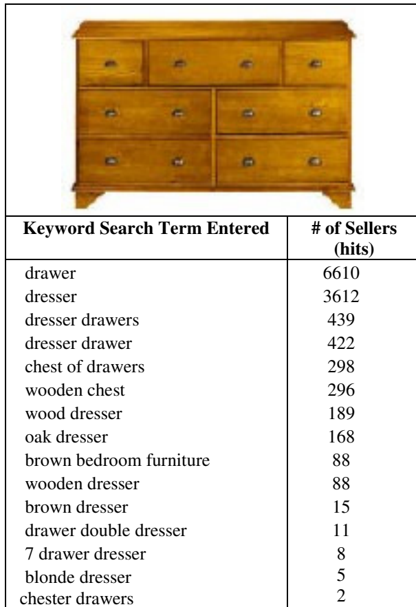
Figure 2. Terms Used and # of Hits for the Image

In terms of language variation in keyword searches, students used a variety of terms to search for the 15 products. For example, when searching for the piece of furniture in Figure 2, 15 different terms were used by 36 students.